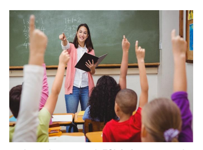
Learn how to teach ESL in just one year!