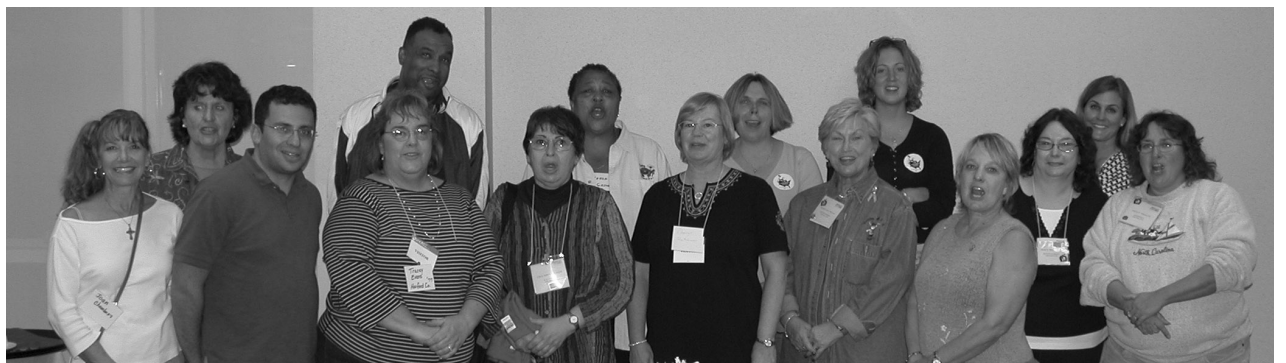
Alumni took a moment in the fun-filled evening to pose for a group photo. We hope to see you all next year!