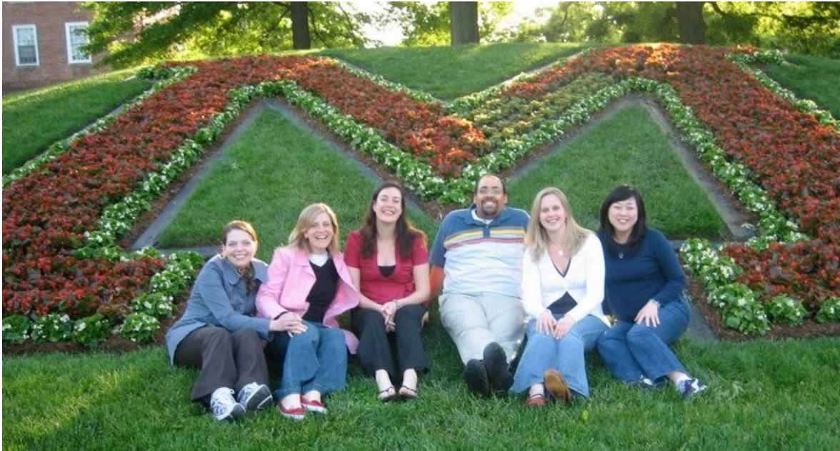
Gotta love these cohort pictures that pop up on Facebook!