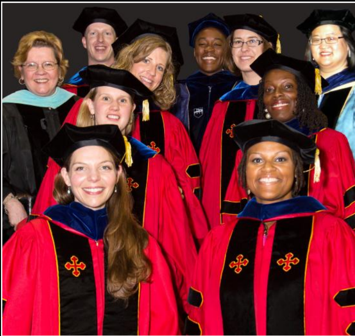
photoshop magic by Sean Sharp